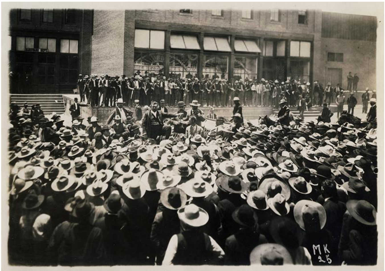
“Photograph of Colonel Greene, from his automobile, addressing the strikers at Cananea, Mexico on June 3, 1906. The conflict is considered the beginnings of the Mexican Revolution.”