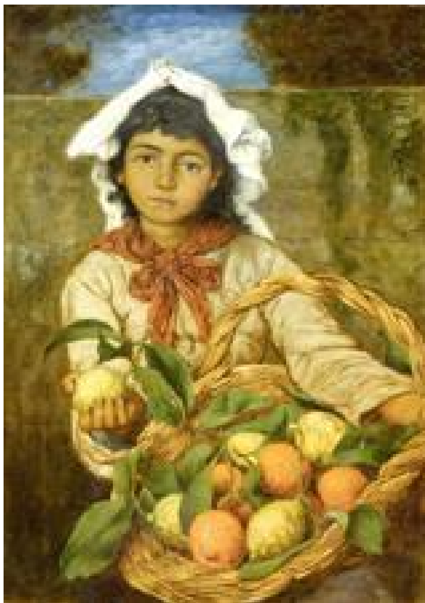
The Lemon Seller, Hans Thoma (1839-1924)

“So then, each of us will be accountable to God.” - Romans 14:12