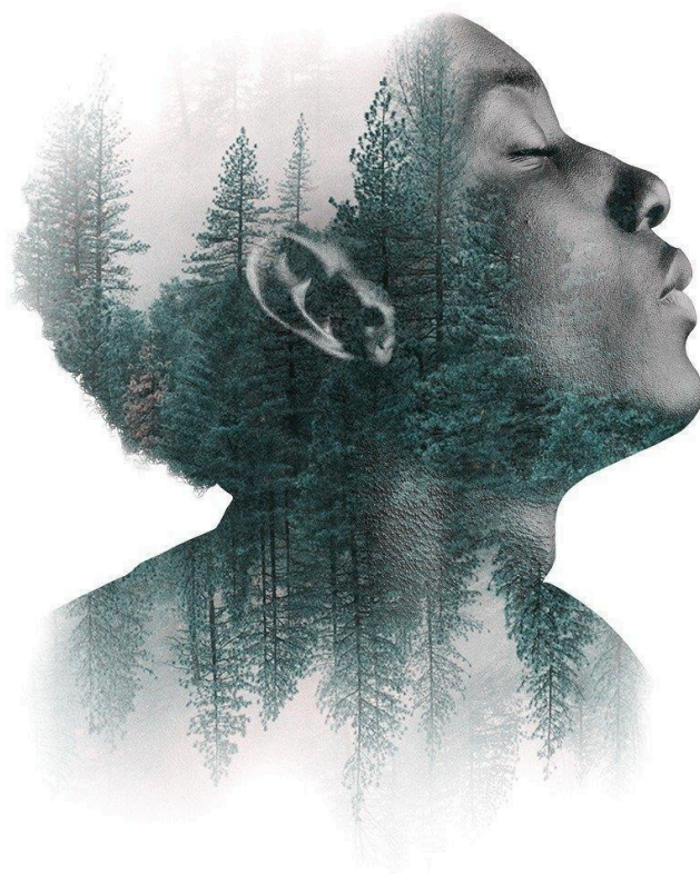
Portrait of a man's face.